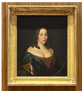
Lady Grace Pierrepont, whose 17th-century donation of books re-established the collection of the Royal College of Physicians after the Great Fire of London