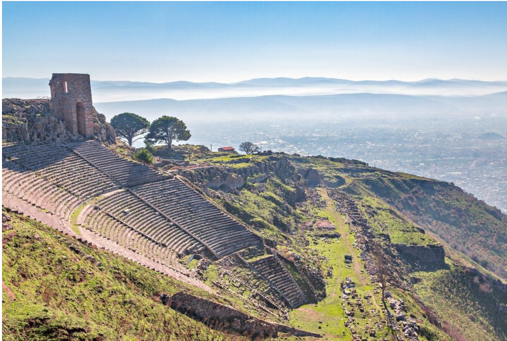
Roman theatre Pergamon

We know from our regular travelers that our tours have led to lifelong friendships, work relationships – and in one memorable case, a marriage!